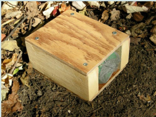
Figure 1: Housing unit for overwinter study of I. scapularis adults.

Our 5-yr study reveals that when there was consistent snow cover, ≥90% of the I. scapularis adults overwintered successfully (Table 1). However, when the winter temperatures were warmer, and the snow completely melted, overwinter survival dropped significantly. In the winter of 2016-2017, warm daytime temperatures were: Feb. 18 [15 °C], Feb. 19 [6 °C], Feb. 20 [5 °C], Feb. 21 [6 °C], Feb. 22 [13 °C], Feb. 23 [15 °C]; the snow cover disappeared completely in the woodlot. Then, without snow cover, there was a series of subzero night-time temperatures: Mar. 3 [-11 °C], Mar. 4 [-13 °C], Mar. 5 [-14 °C]. Because of these exquisitely cold temperatures, only 10/30 (33%) of the I. scapularis adults survived the winter.